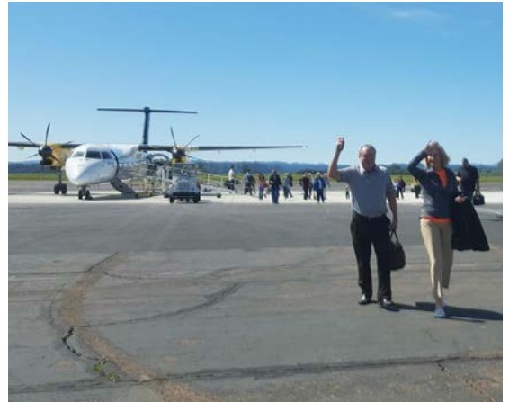
First arriving passengers from Orange County

"STS is the easiest Airport ever, and a great asset to this community - thank you!"