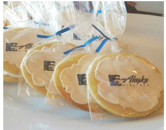
Homemade logo cookies by Alaska Airlines

Goodie bags provided by Sonoma County Tourism; Snoopy character provided by Charles M. Schulz Museum