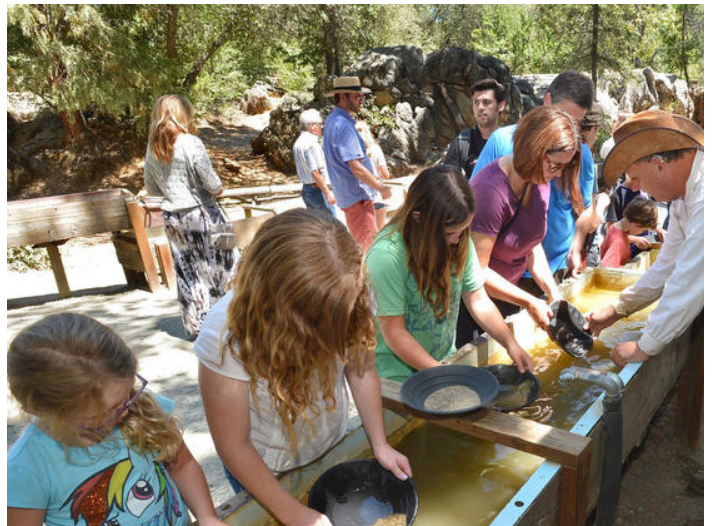
Mining for gold at Columbia Historic State Park