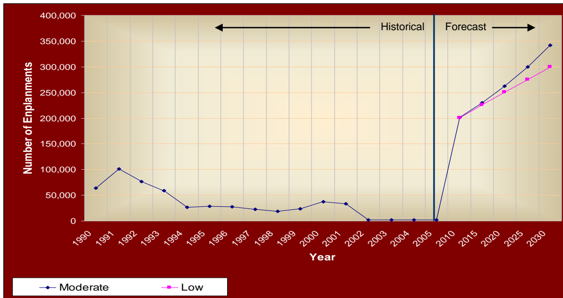
FIGURE 1. STS Annual Enplanements

Figure 1 is a graphical representation of the historical enplanements and forecast low growth and moderate growth enplanements projections for STS. 14 As can be seen from the figure, neither the moderate growth scenario nor the low growth scenario would exceed the County’s proposed ATE 2020 annual enplanement limit of 286,500. The moderate growth scenario could exceed 286,500 annual enplanements around 2023 and the low growth scenario could exceed this level a little later, around 2027.