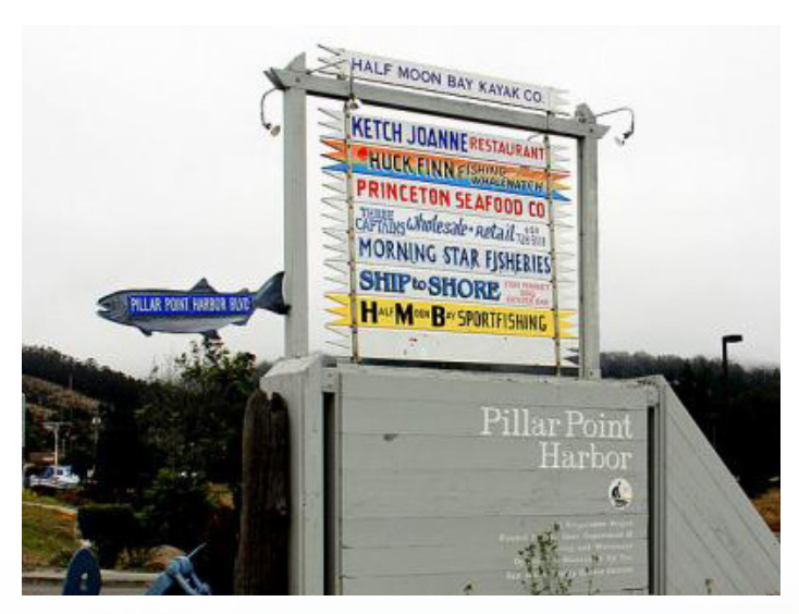
Pillar Point Harbor shops and restaurants.