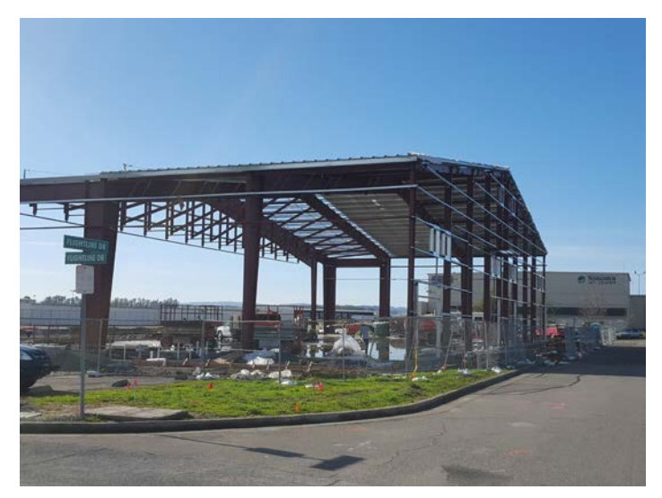
Construction as of January 15, 2016.

Sonoma Jet Center offers an elegant executive terminal, Avfuel branded aviation fuels, aircraft maintenance, tiedowns, hangar space, and concierge service. Serving both corporate aviation clients and smaller owner/operators, Sonoma Jet Center is an independently owned and operated Signature Select affiliate with a reputation for safe and efficient operations, first-class VIP service for every customer large or small, and a passion for aviation.