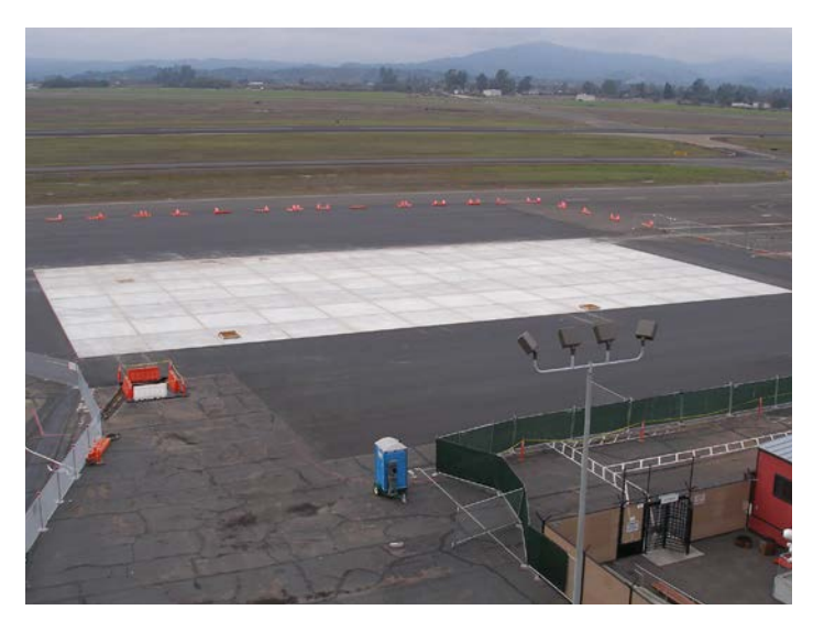
Concrete pad complete.