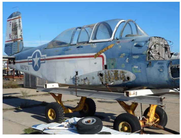
The T-34 is still in need of assembly and restoration but will be an interesting and important addition to the Pacific Coast Air Museum collection.

The Pacific Coast Air Museum is located at the Charles M. Schulz - Sonoma County Airport, at One Air Museum Way. That's near the corner of N. Laughlin and Becker.