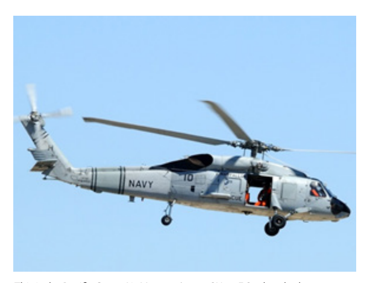
This is the Pacific Coast Air Museum's new SH-60F Seahawk, shown performing in an air show several years ago. It is no longer flyable, and will be the most modern helicopter in the Museum's collection of static-display aircraft.

Just watch for all the vintage airplanes behind the fence. Hours are Saturday, Sunday, Tuesday, and Thursday from 10:00 a.m. through 4:00 p.m. Visit www.pacificcoastairmuseum.org for details. We look forward to seeing you!