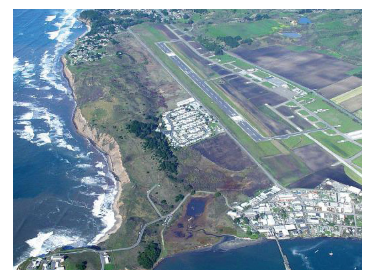
Half Moon Bay Airport aeriel view.

Princeton is a great little place, with many great restaurants, a marina, a working harbor with fishing boats and some great deals on really fresh fish. It also has a nice beach, and you can even watch the surfers take on the famous Mayericks.